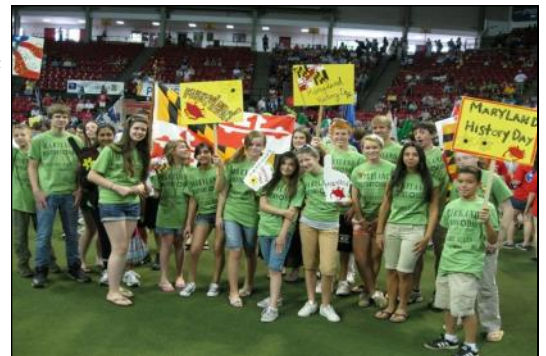
Maryland’s NHD student competitors